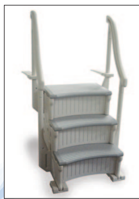
Inground Stair Case