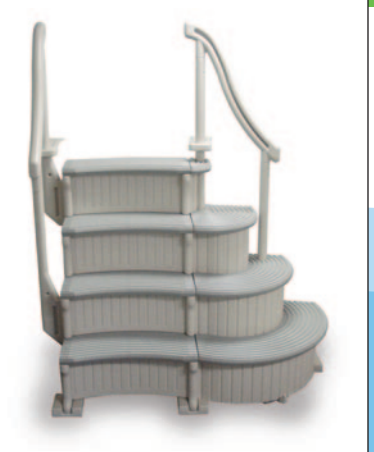
Above Ground Curve System