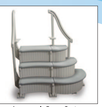
Inground Curve System