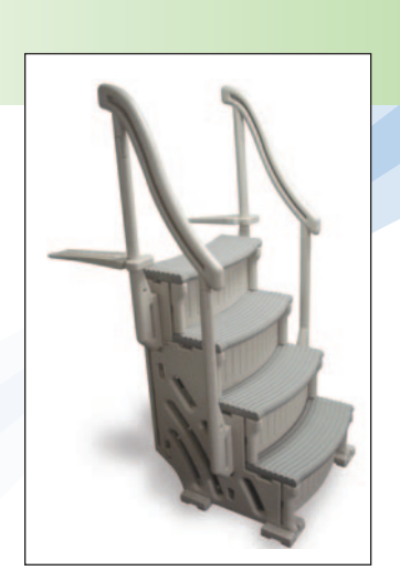
Above Ground Stair Case